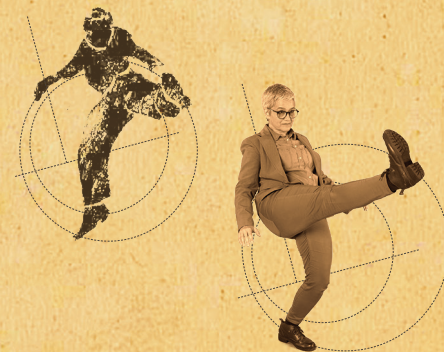
Pastinha founded the first capoeira angola – or traditional-style – school in 1941.