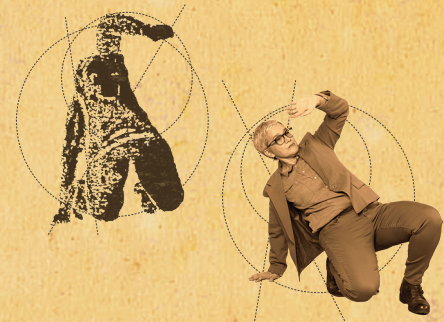
He illustrated his manuscript by tracing the work of photographer Pierre Verger.