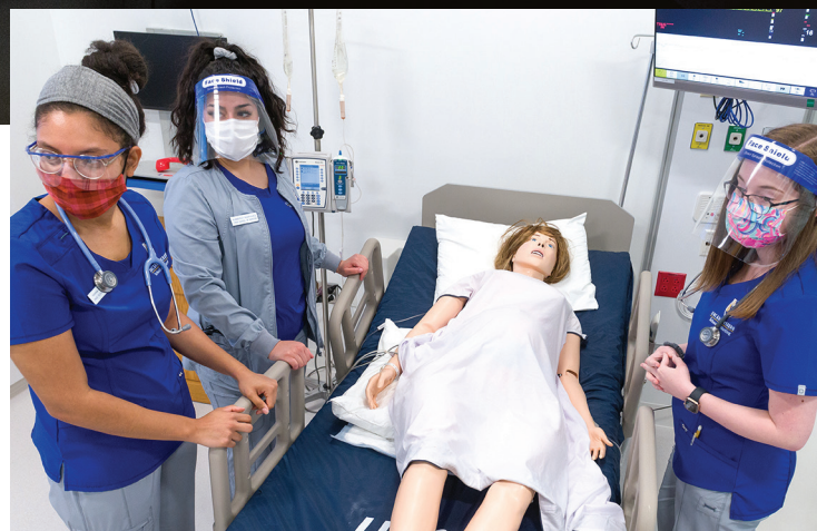
Nursing students electronically monitor the vital signs of a mannequin representing a pregnant person and their fetus, during a simulation.